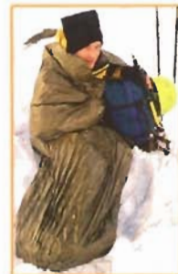
Survival Sleeping Bag